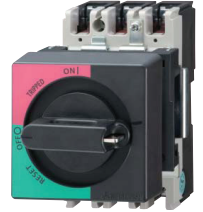
V-Type Operating Handle