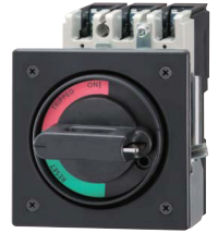
F-Type Operating Handle